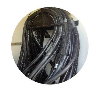
EASY ACCESS Military grade Hook & Loop closure reduces installation and/or service time by up to 70%.