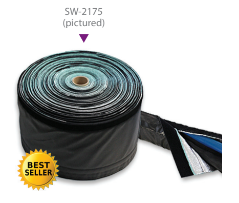
OPTIMIZED FOR SPF Sidewinder is designed to resist water and petroleum, UV rays, and crisp edge applications.