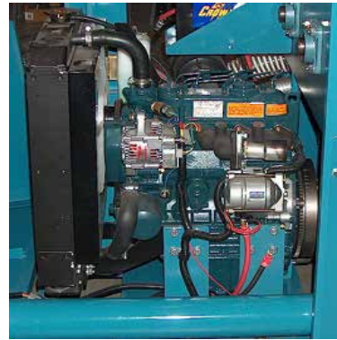
23 1/2 Hp Kubota Diesel Engine

Backed by a manufacturer's 2-YEAR WARRANTY - Made in the U.S.A.